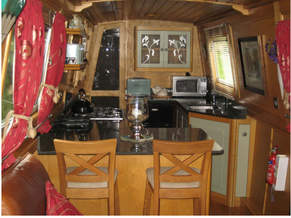
Page 4 of 7 Last updated 22 July 2015