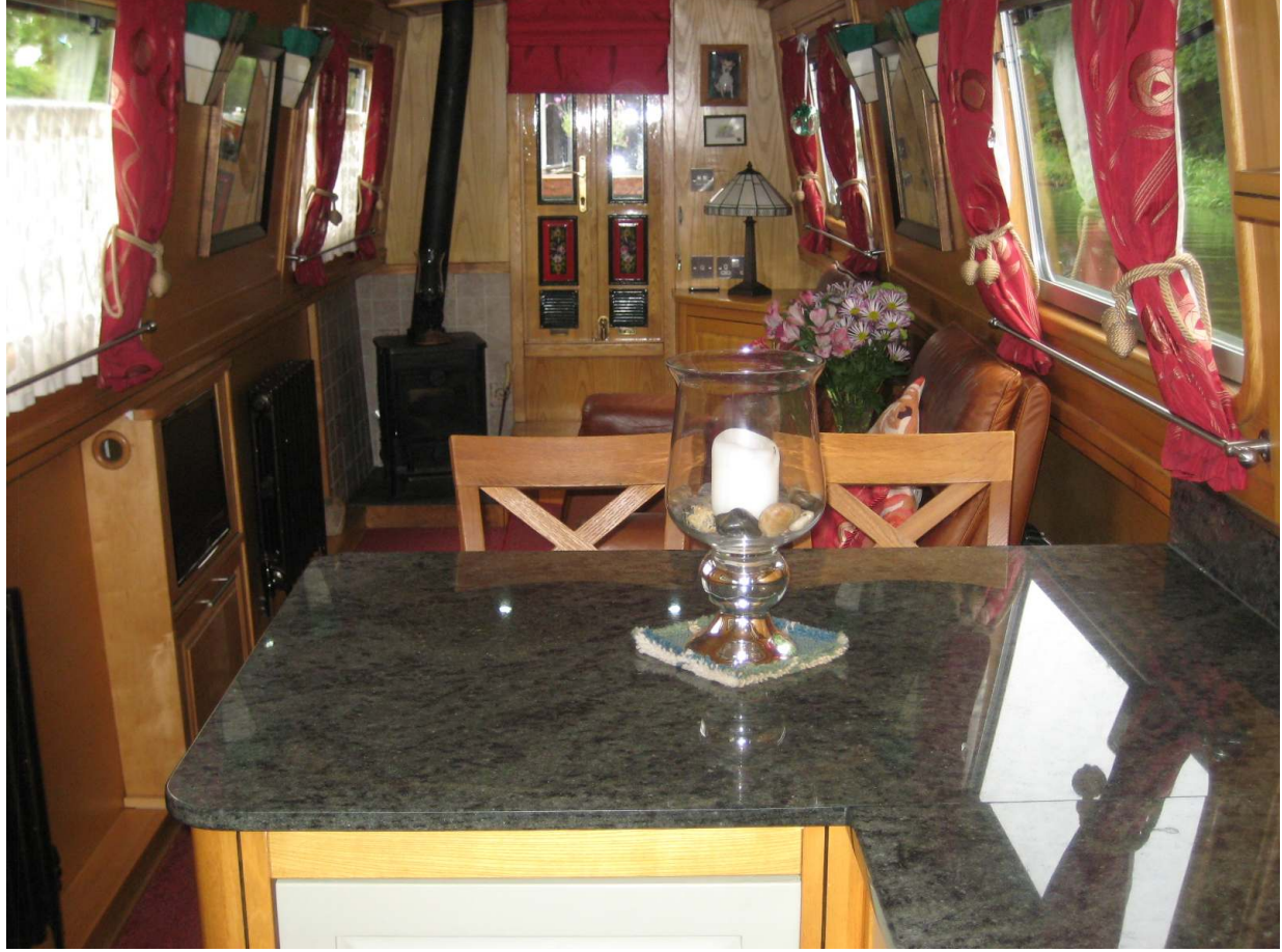
Page 6 of 7 Last updated 22 July 2015