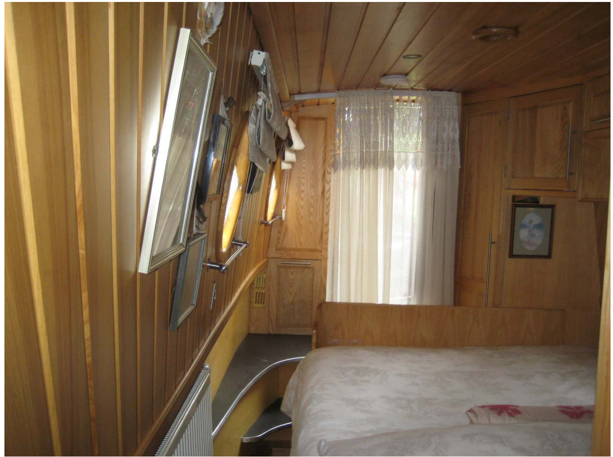
Page 5 of 7 Last updated 22 July 2015