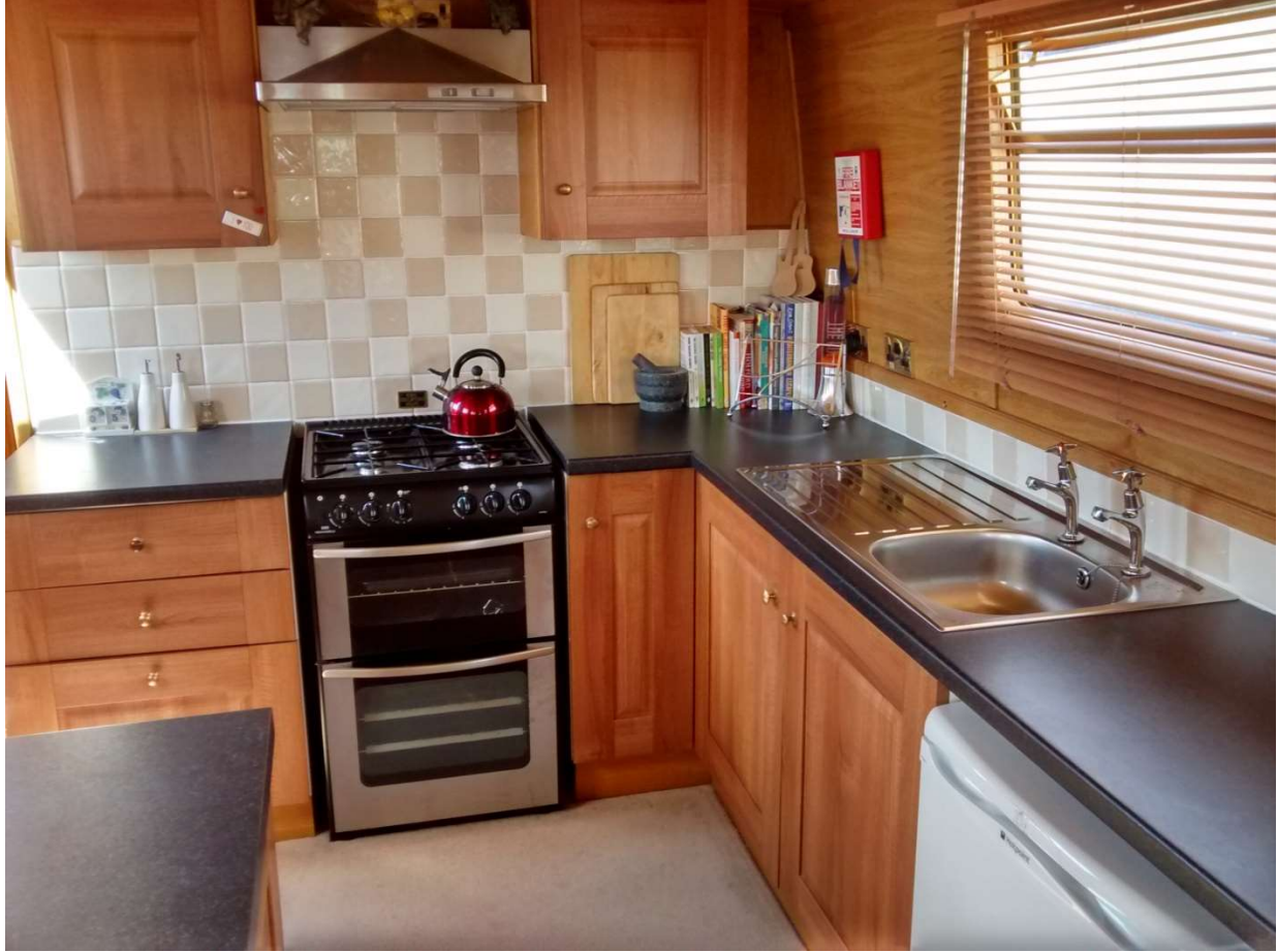
Page 7 of 13 (updated June 2015)