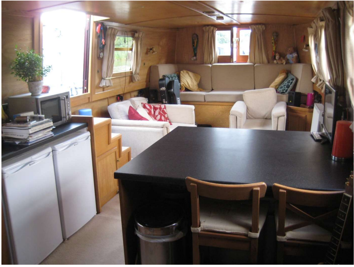
Page 5 of 13 (updated June 2015)