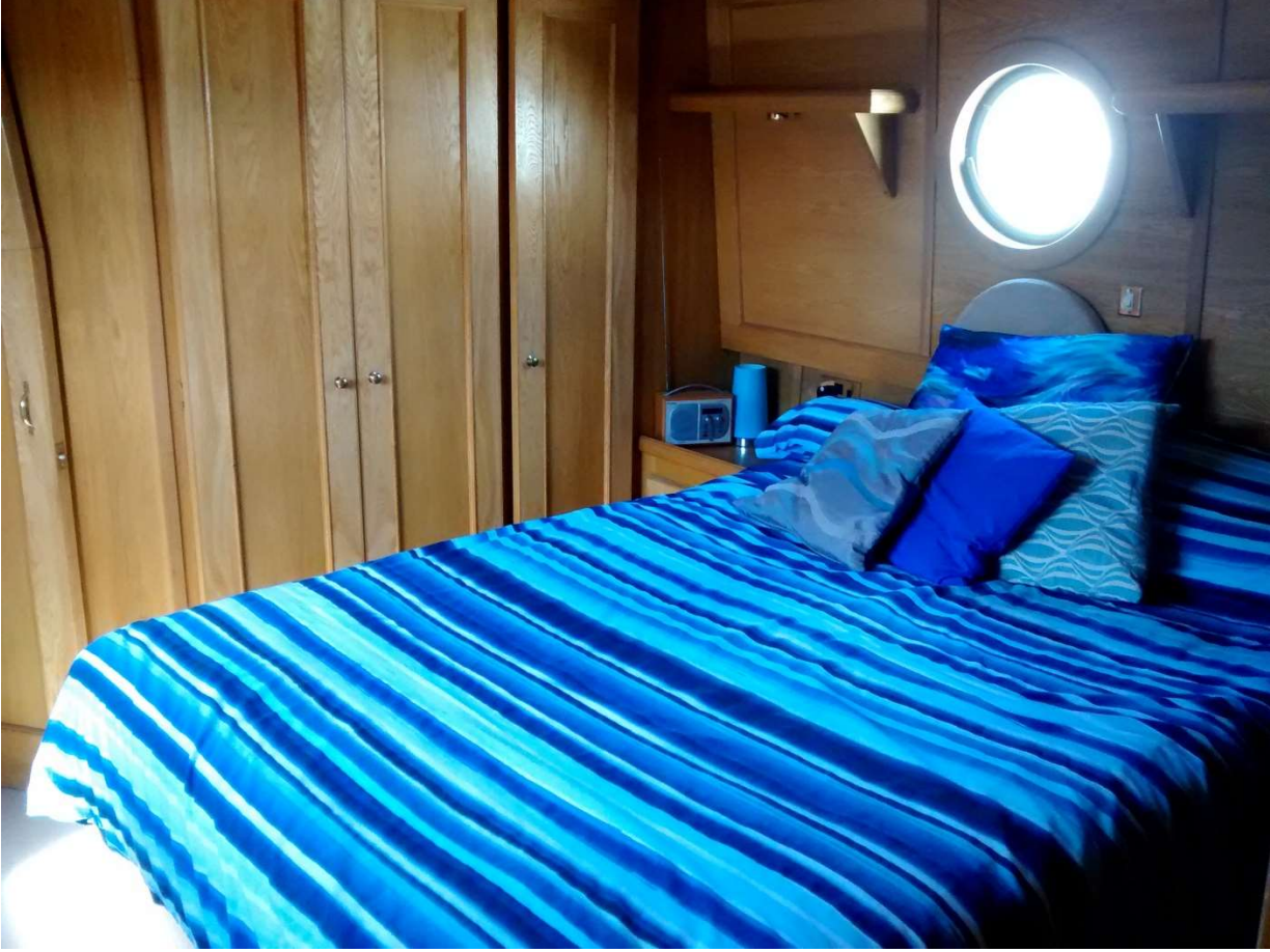
Page 8 of 13 (updated June 2015)