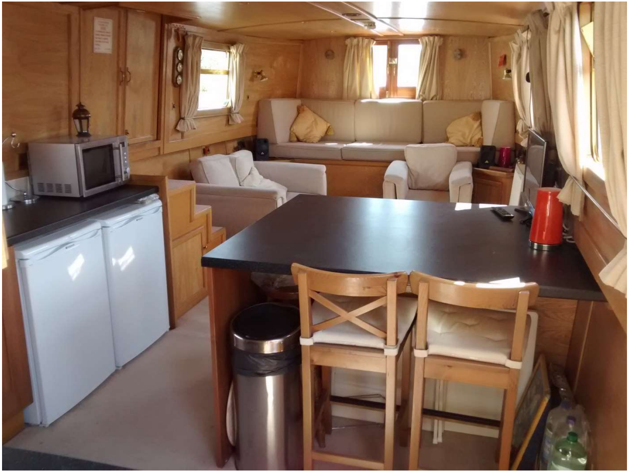
Page 6 of 13 (updated June 2015)